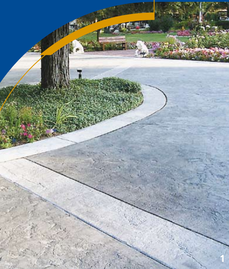
1 This continuous rustic 'pattern-scape' is possible with the CCS Sierra Seamless Stone mat. Colours:- CCS Storm Grey and CCS Shale Grey with CCS Black Release Agent.

For more information on the patterns and colours available, (including our complete range of pigments for integrally coloured concrete), please talk to your local applicator or visit www.concretecoloursystems.com.au .