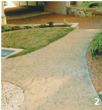
2 Above: A random rock finish creates an attractive walkway. Mat Design:- CCS Large Random Stone Mat Colours:- CCS Camel with CCS Rustic Brown Release Agent.