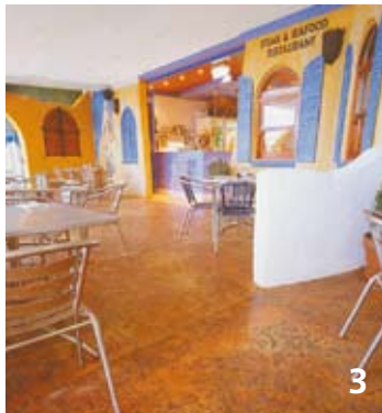
3 Above: This indoor café has been given added charm and character with the CCS Seamless Rough Stone finish. Colours:- CCS Terracotta and CCS Harvest Gold with CCS Storm Grey Release Agent.