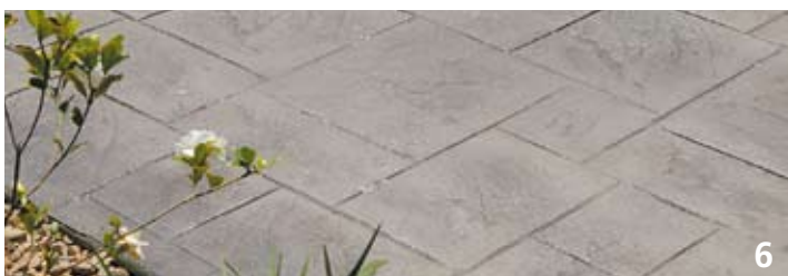
6 The 'naturally appealing' slate patterns are both timeless and practical, particularly for driveways. Mat Design:- CCS Ashlar Slate Mat. Colours:- CCS Storm Grey with CCS Dark Black Release Agent.